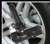
Tire Pressure Monitoring Sensors