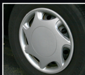
Cosmetic Damage to Hubcaps