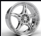
Cosmetic Damage to Chrome/Chrome Clad