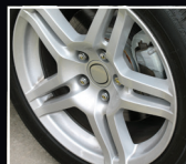
Aftermarket Wheels with no Surcharges