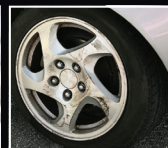
Cosmetic Damage Wheel Replacement